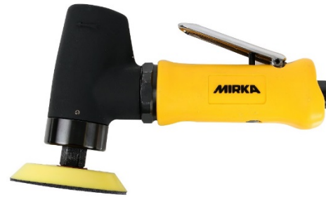
Mirka AP 300NV 77 mm