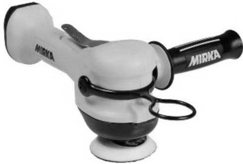
Mirka RP2 300NV 77mm